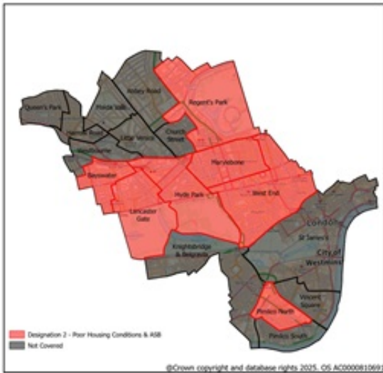
Annex A - Selective Licensing Designation 2