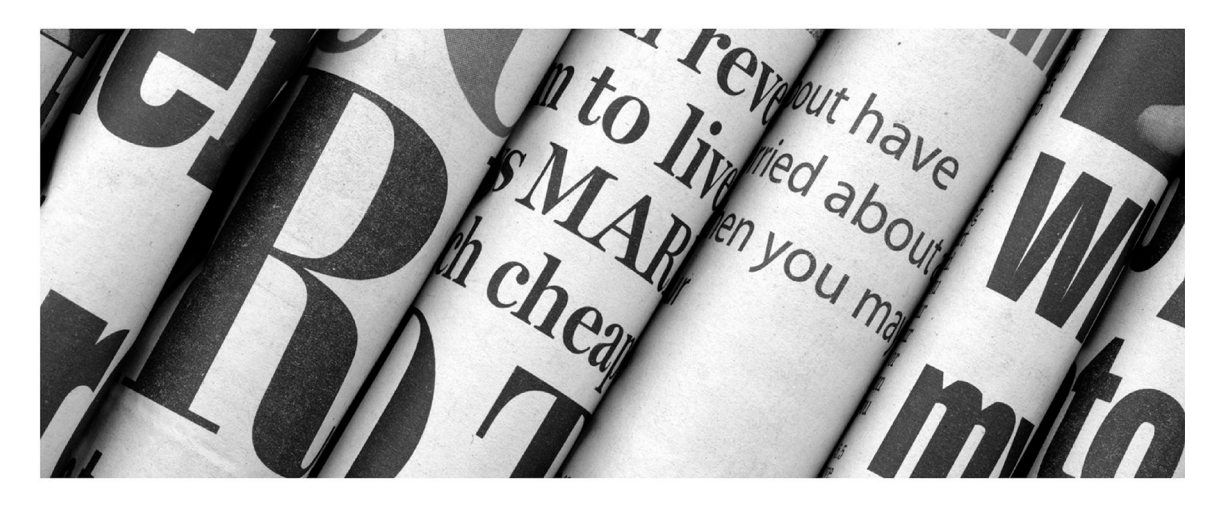
To place a notice visit www.thegazette.co.uk/wills-and-probate/place-a-deceased-estates-notice